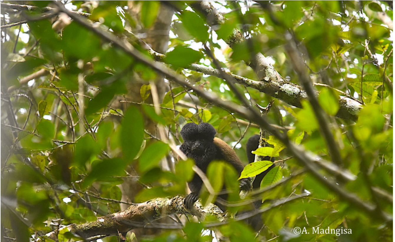
One you don't meet very often; the Guianan Bearded Saki .