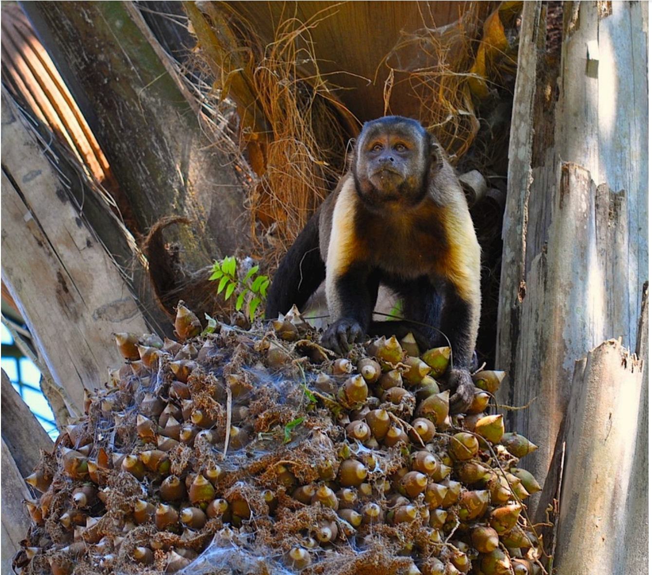
Loved by many: the Maripa Palm.