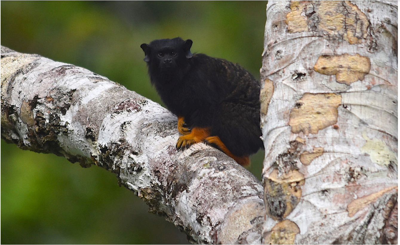
A close encounter with a Golden-handed Tamarin.