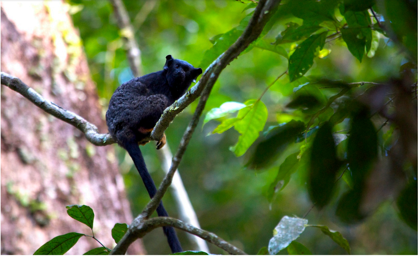
Caught red handed at the Suites: the Golden-handed Tamarin.